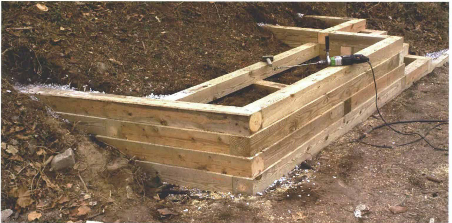
7. Cross tie connects sidewalls and tieback. Finishing the wall is now a commonsense matter of cutting, stacking and spiking timbers together log-cabin style. Fill behind the wall, alternating lifts of soil behind the filter fabric and 1 ft. of gravel between the wall and the fabric. Fill stairs with gravel.